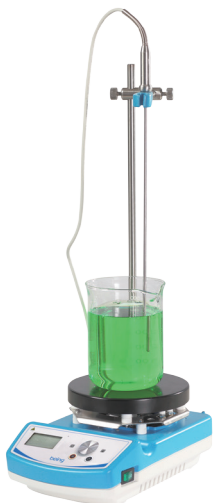
Magnetic stirrer to measure liquid temp.