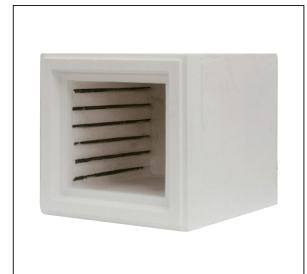
Ceramic fiber furnace