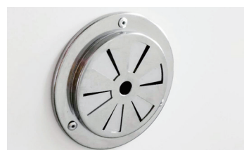
Pressure balance hole