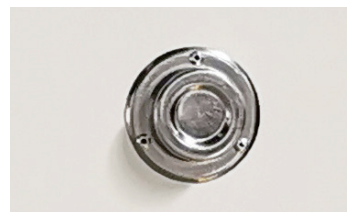
25mm test hole