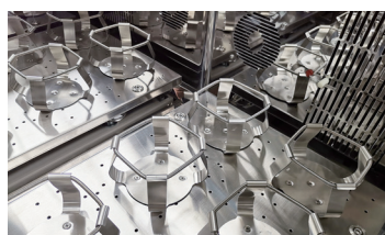
304 mirror stainless steel