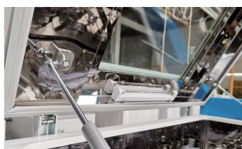
Pneumatic gas spring holder